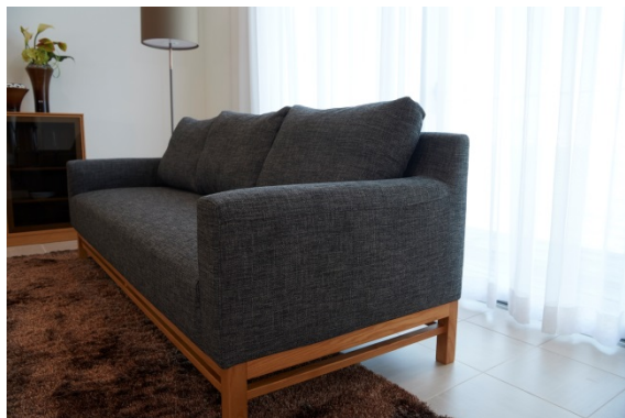
PAOLO SA2000 BALOO205 脚部:NO