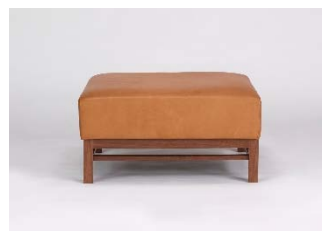
PAOLO STL800 M35-80 脚部:WN