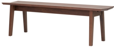
STANNA・GIO BEN WN