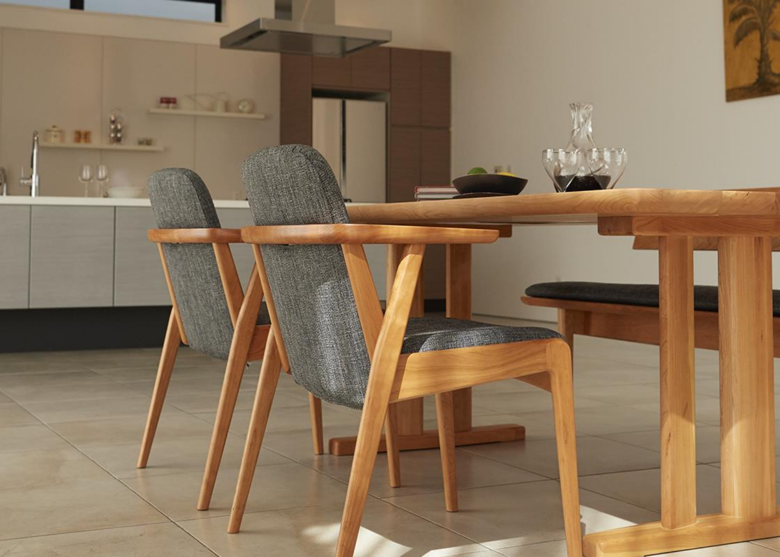
STANNA DT-2 CH / STANNA DCH CH BALOO 205