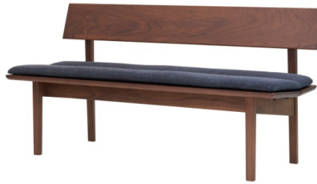
STANNA・GIO SBN WN / CUS サブリエCGR