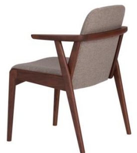
STANNA DC - H