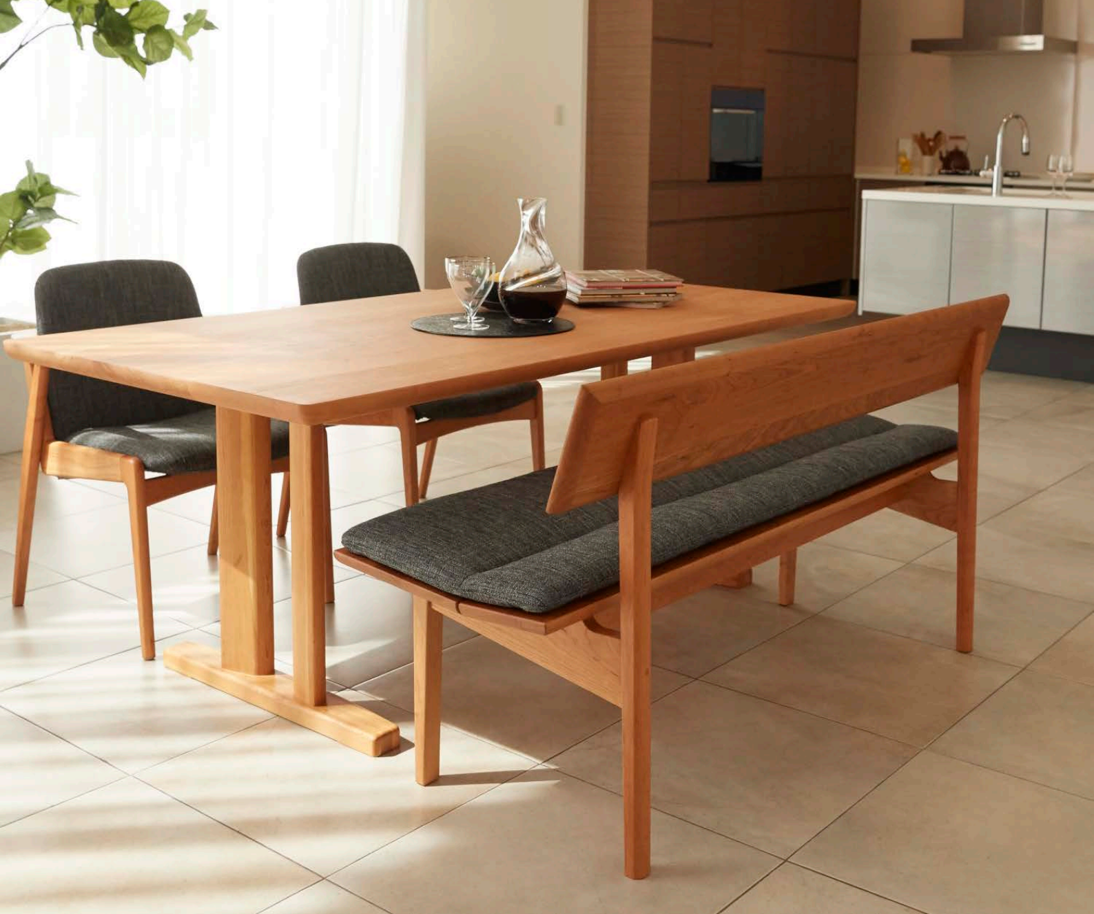
STANNA DT-2 / DCHx2 / SBN CH / CUS BALOO205